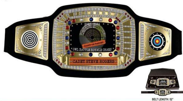
Black is the Experienced Firer Championship Belt