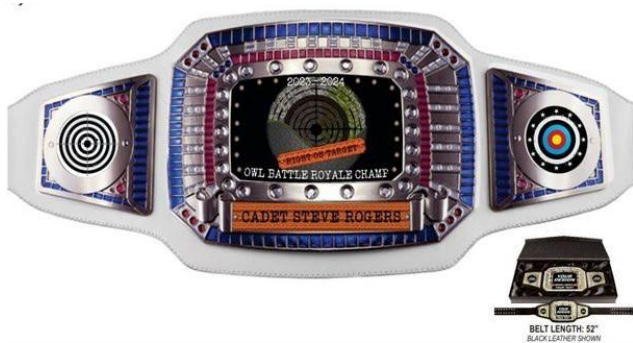
White is the New Firer Championship Belt